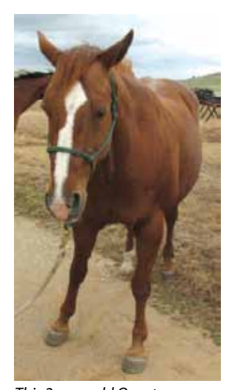
This 2-year-old Quarter horse gelding shows the dull mentation (mental activity) characteristic of NAD/EDM.

A video showing some of the clinical signs of NAD/EDM may be viewed in the electronic (Zmag) version of this Horse Report available at http://www.vetmed.ucdavis.edu/ceh/current.cfm.