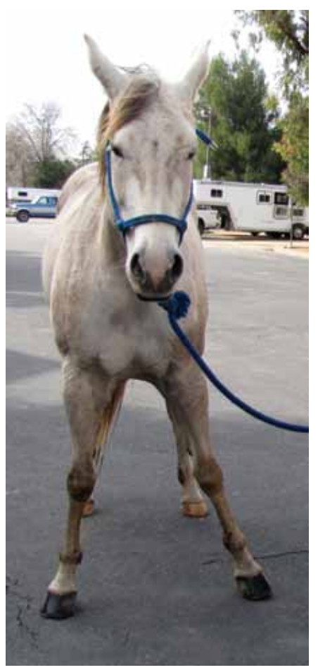
A 5-year-old Quarter horse mare with the abnormal base-wide stance of the forelimbs characteristic of NAD/EDM.

forelimbs. Affected horses will often stand abnormally at rest (see photos), either too wide or too narrow, and will display proprioceptive deficits, which means that the horses do not know where their limbs are as they walk.