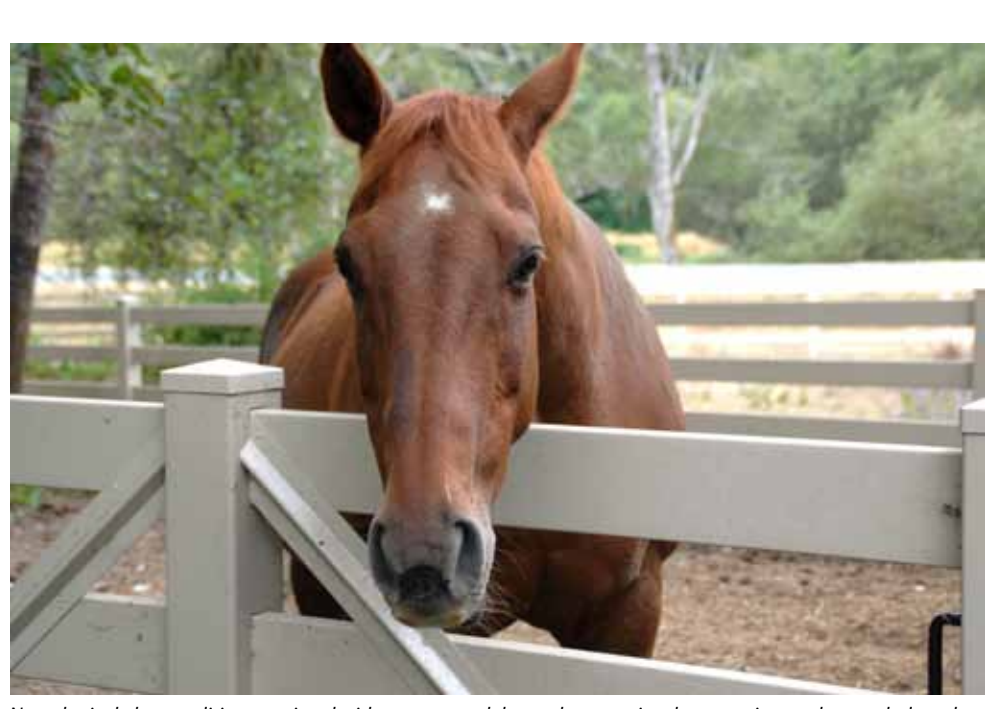
Neurological abnormalities associated with neuroaxonal dystrophy or equine degenerative myeloencephalopathy can be subtle and may be missed for years unless the horse is specifically examined for neurological disease. Mild cases may present with performance-related issues, where the horse is just not performing up to the standard expected for its breeding and training.

euroaxonal dystrophy (NAD) is a neurological disease in which both the cell body of the neurons and the axons throughout the brain and spinal cord undergo degeneration. Axons are the parts of the nerve cells along which impulses travel, so this condition results in abnormal conduction of nervous impulses and associated clinical signs defined by a lack of coordination. The cause of this degeneration is not understood at this time.