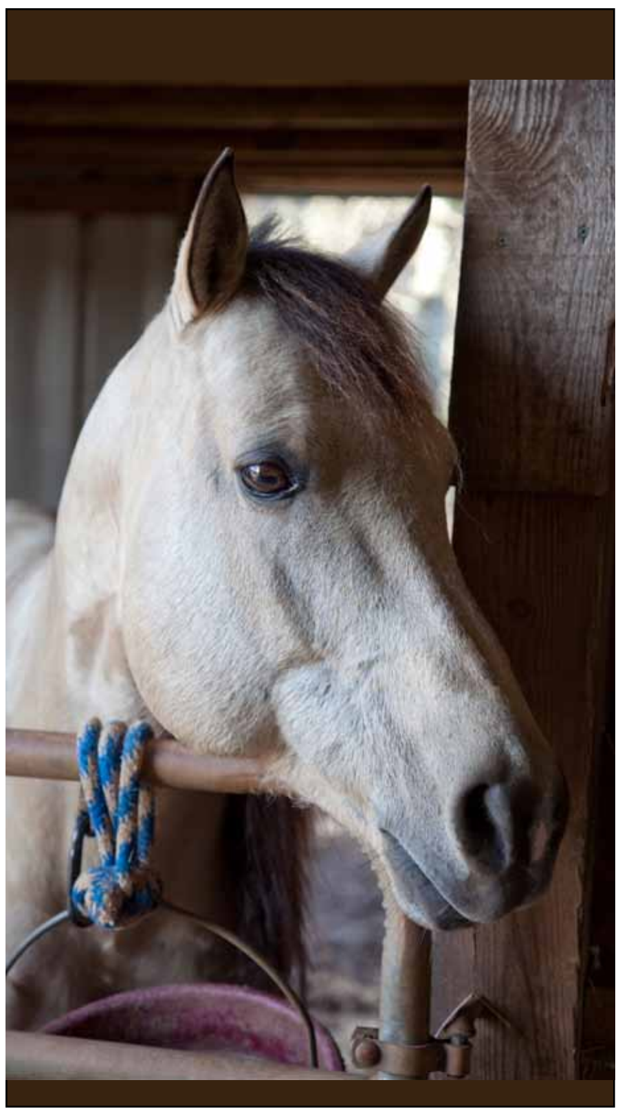
One of the ways that horses can catch an infectious disease such as EHV-1 is by direct contact with another horse or with equipment used for an infected horse. It's best to use separate water buckets, feed troughs, tack and grooming equipment for each of your horses. If equipment must be shared, it should be dipped in a disinfecting solution (see page 9), washed and dried before use on another horse.