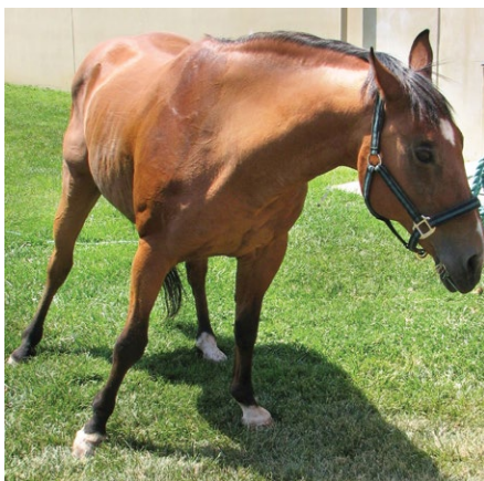
Horses affected by the parasite that causes EPM may appear neurologic.