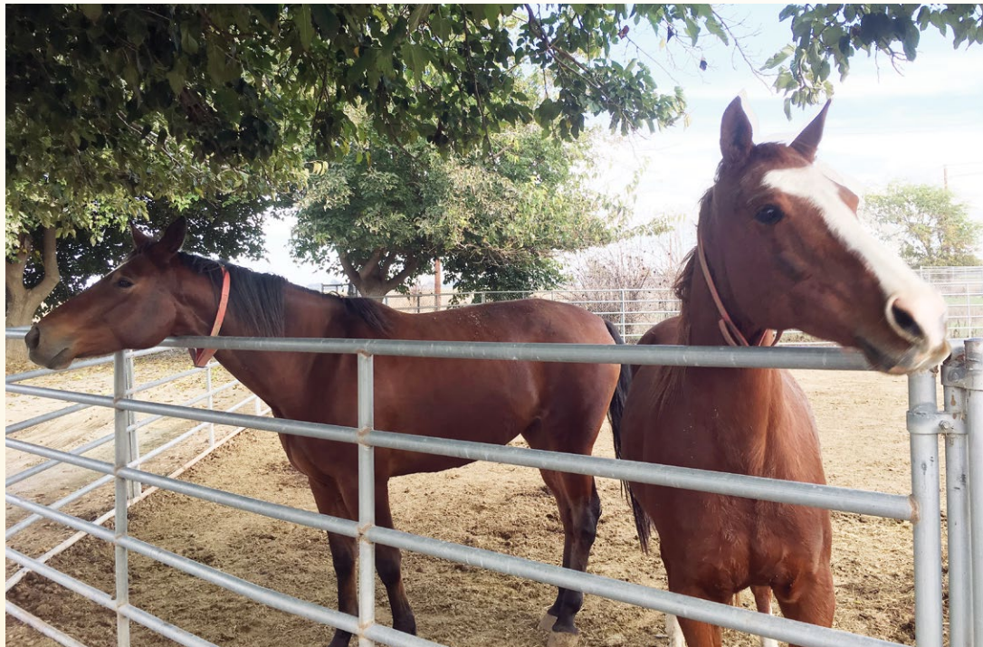
These Center for Equine Health residents participated in a long-term rabies vaccination study funded by the center.

“There is an increasing body of evidence that protective antibody titers persist for three years for many pathogens