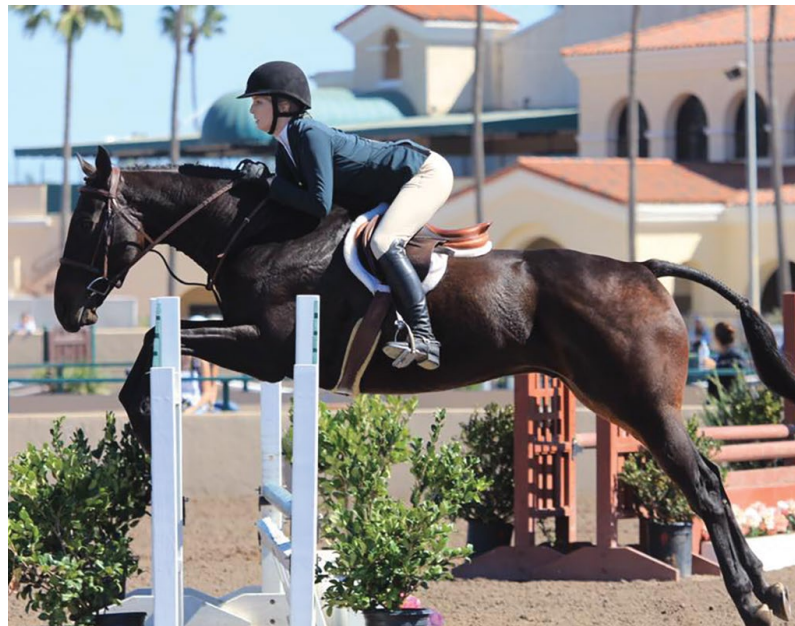
Krazy Flyer enjoys his new career.