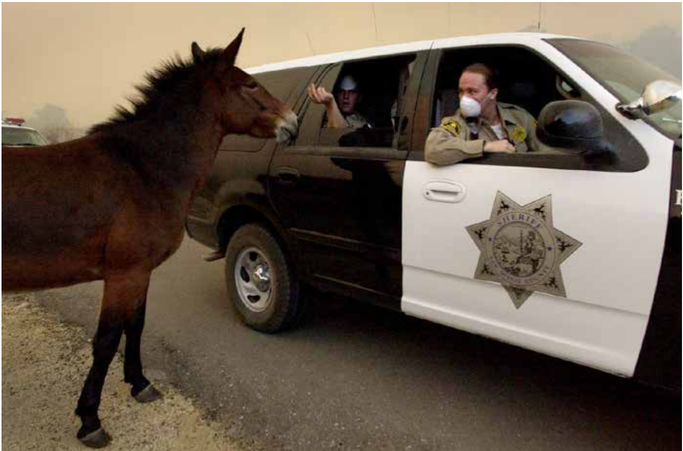
San Diego County Sheriff's deputies can only look at a wayward mule that refused to get into a horse trailer in Julian, CA. The deputies tried carrots and potato chips but had no luck.

disasters. In past years, they hosted numerous workshops in several counties of California to educate and inform in some of the most significant efforts in recent years to secure the safety of animals.