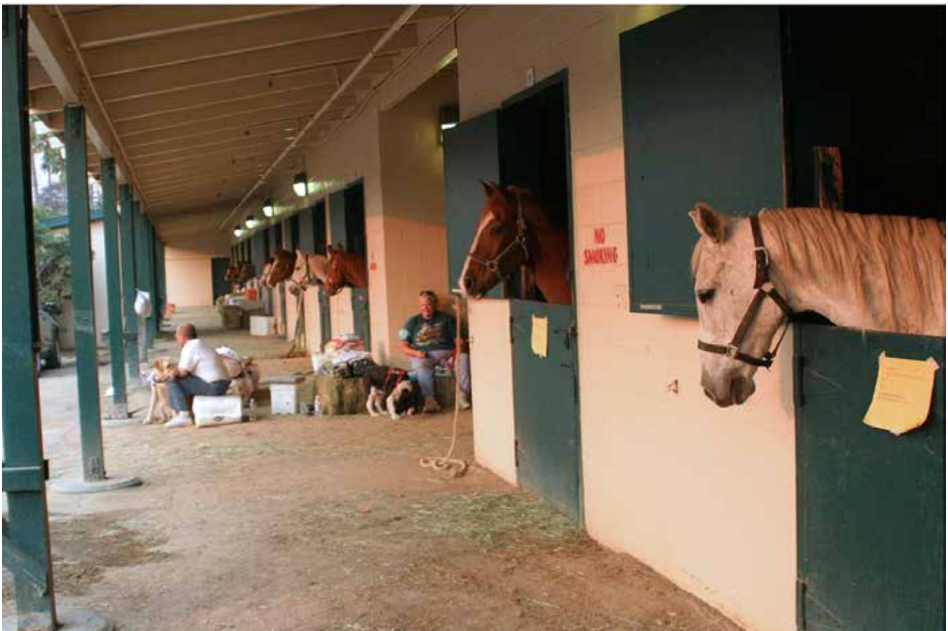
Horses and their owners were successfully evacuated to the Del Mar Fairgrounds during the San Diego County fire of October 2007.

UC Davis WIFSS (Western Institute for Food Safety and Security) disaster preparedness site: www.wifss.ucdavis.edu/?page_id=5408