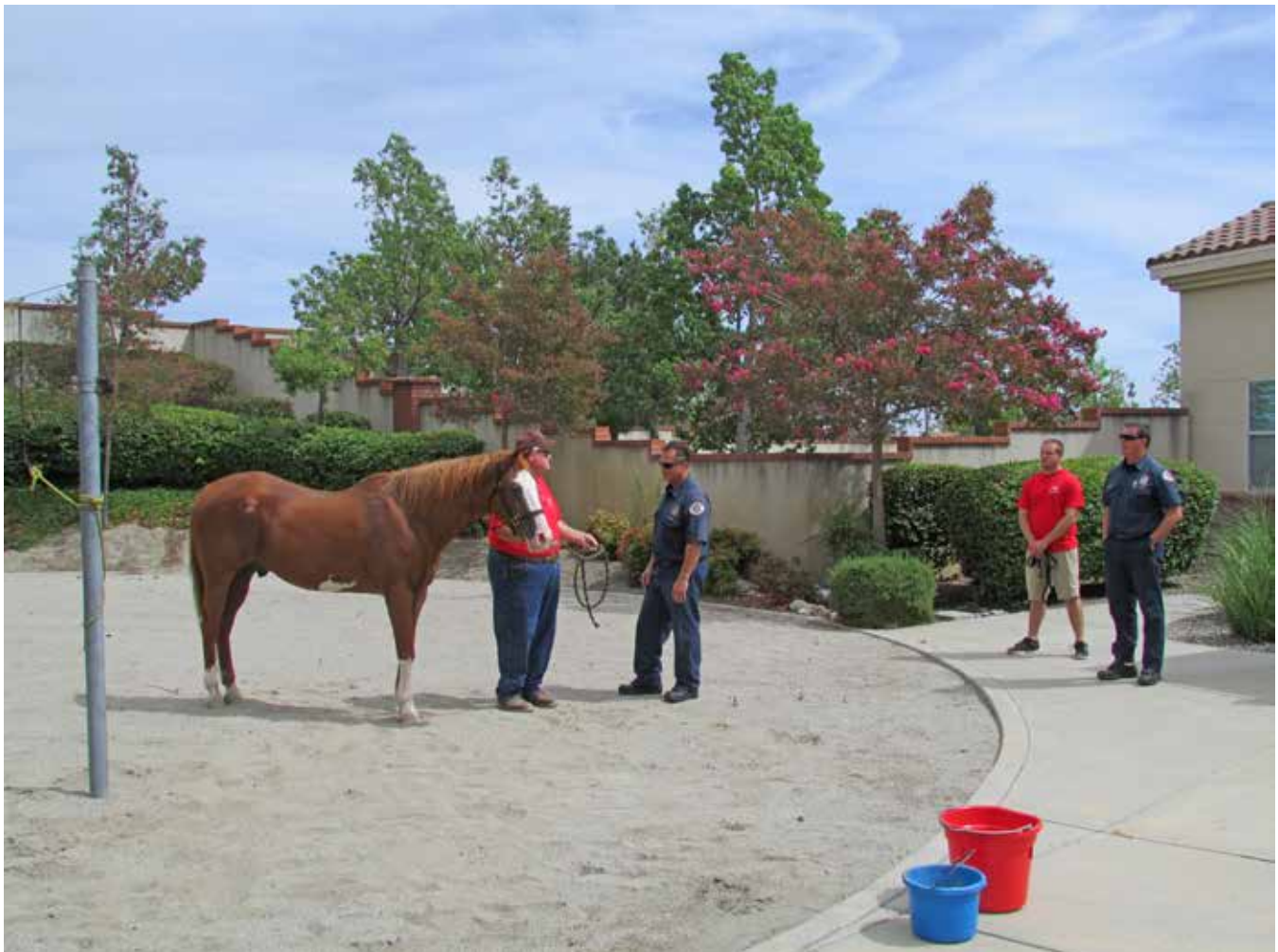
Rancho Cucamonga's ALERT team (Alta Loma Emergency Response Team) trains with city Fire Department personnel in the handling of horses.