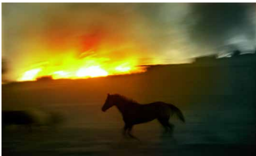
A horse runs inside a horse racetrack as the Cedar Fire burns in the background.

In addition to earthquakes, wildfires are a given in California. The King Fire in the north, currently in progress, has burned over 96,000 acres and is only 68% contained. Last year, the Rim Fire,