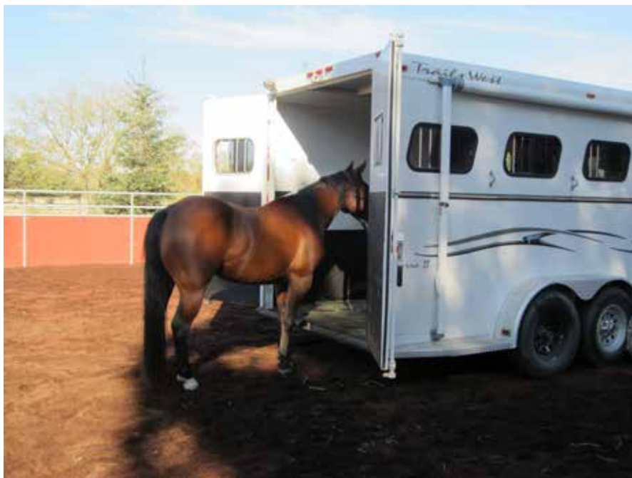
Hickory contemplates a request to go in the trailer. Enticed by some grain, he goes right in. Enticement will not work with horses who have not been properly trained to load and unload into a trailer.