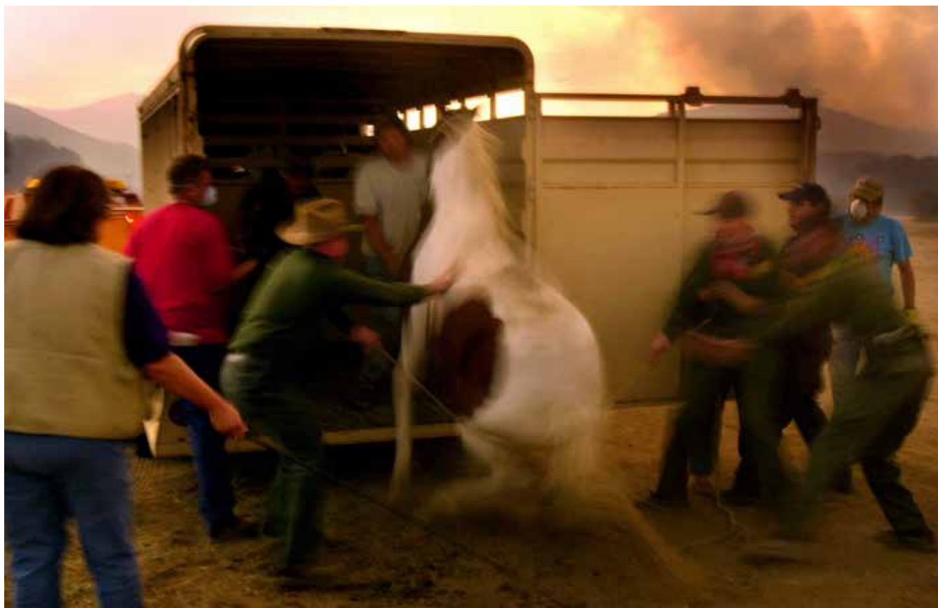
Border patrol agents and volunteers try to get a frightened and reluctant horse into a trailer during the Cedar Fire.