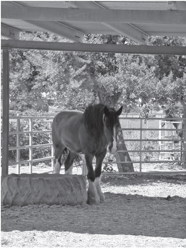
In areas of temperate winters and more days of heat and sunshine, simple pole and roof constructed shelters which protect from moderate rain and intensive heat may be preferable.

more horses is to allow 120 square feet for each of the first two horses, then 60 square feet for each additional horse with access to a given shelter. As with stalls, any water sources or electrical lighting supplied must be properly constructed and protected from the strains of horse manipulation and weather. If feed bunks are to be included in shelters, they should be of sufficient numbers or be large enough so that all horses can feed at once and avoid aggressive behaviors between animals.