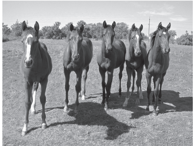
Horses develop strong social attachments to individual herd mates. Consequently, the grouping of individual hoses within pens, corrals, dry lots and pastures should be done with careful consideration.

visual contact with other horses or animals on the property. When selecting horses for cohabitation, the gender, age, health, and individual disposition should be considered to avoid confrontational and aggressive behaviors such as fighting. All newly arrived horses should be quarantined (2-3 weeks) before mixing with resident horses. Before new horses are co-mingled, they can be exposed to the group by allowing an across-the-fence acquaintance period. All introductions of